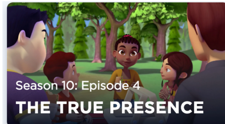
Video: The Liturgy of the Eucharist