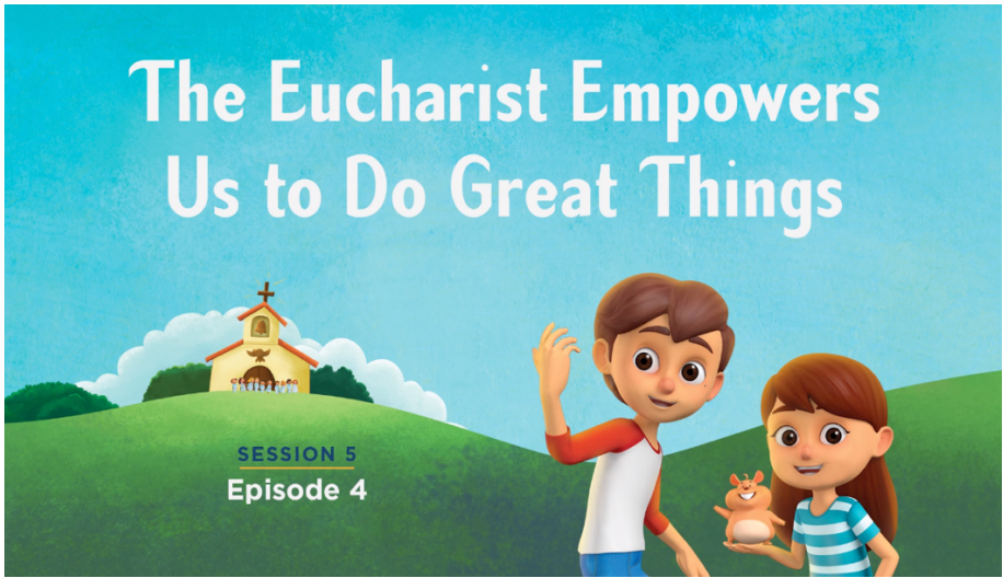
Lesson 5 Video: Your First But Not Your Last