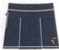
Formal Skort $31.00