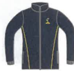
Formal Jacket Soft Shell $82.00