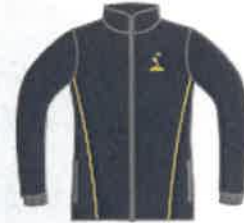
Formal Jacket Soft Shell $82.00