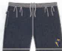
Sports Shorts $32.00