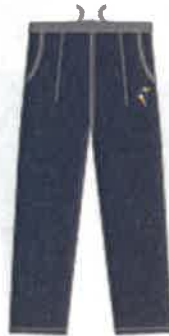
Formal Pants $43.00