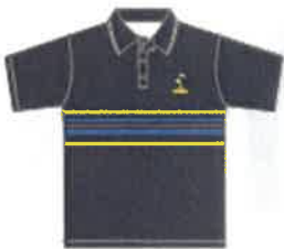
Sports Shirt Short Sleeve (summer) $49.00