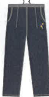
Formal Pants (optional) $43.00