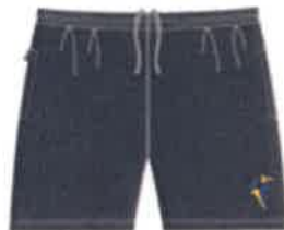
Summer P47 Shorts #52665 $32