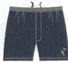
Formal Shorts $32.00