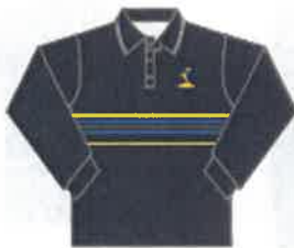
Sports Polo - Long Sleeve (optional for winter) $53.00