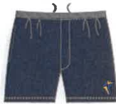
Formal Shorts $32.00