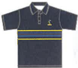
Sports Shirt Short Sleeve (summer) $49.00