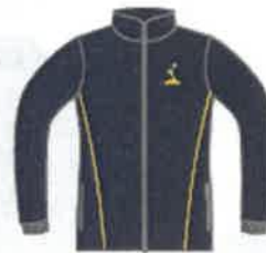
Formal Jacket Soft Shell $82.00