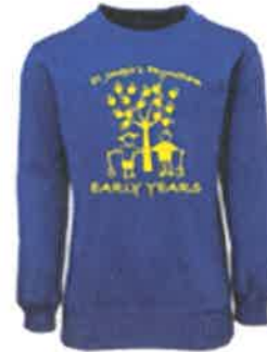
Winter Windcheater #63339 $30