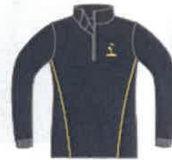
Sports Jumper Boss Top (1/4 Zip) $52.00