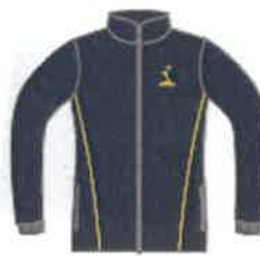
Formal Jacket Soft Shell $82.00