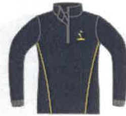
Sports Jumper Boss Top (1/4 Zip) $52.00