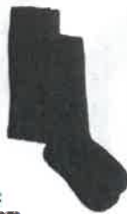
Formal Navy Tights $15.00