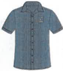
Formal Shirt Short Sleeve $48.00