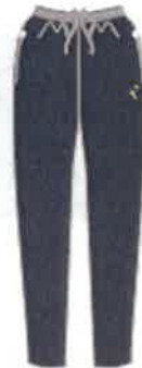
Sports Track Pants $43.00