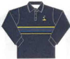
Sports Polo - Long Sleeve (optional for winter) $53.00