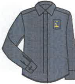
Formal Shirt Long Sleeve $50.00