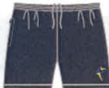
Sports Shorts $32.00