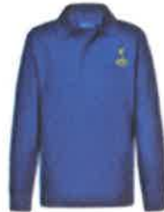
(Optional) LS Preschool Polo Shirt #62299—$24