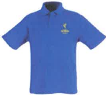
Summer Preschool Polo Shirt #62298—$22